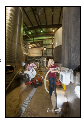
The VESTA Alliance developed partnerships with 2-year colleges and universities in 23 states and has a national footprint under which 2,000+ students having enrolled from 47 states and DC along with students from 13 other countries. Over 600 vineyards and wineries in 39 states that have served as mentors and commercial sites hosting students during their field practicums.