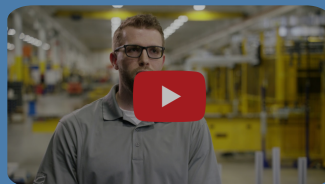
JR Automation Engineering (2:26)