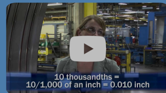
Meet a Manufacturing Engineer (4:24)